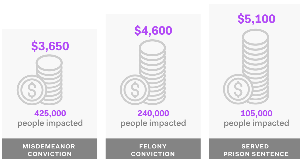
ESTIMATED ANNUAL EARNINGS LOST BY TYPE OF CRIMINAL JUSTICE SYSTEM INVOLVEMENT

People who have been to prison lose an estimated $5,100, or 52% of annual earnings, following their incarceration