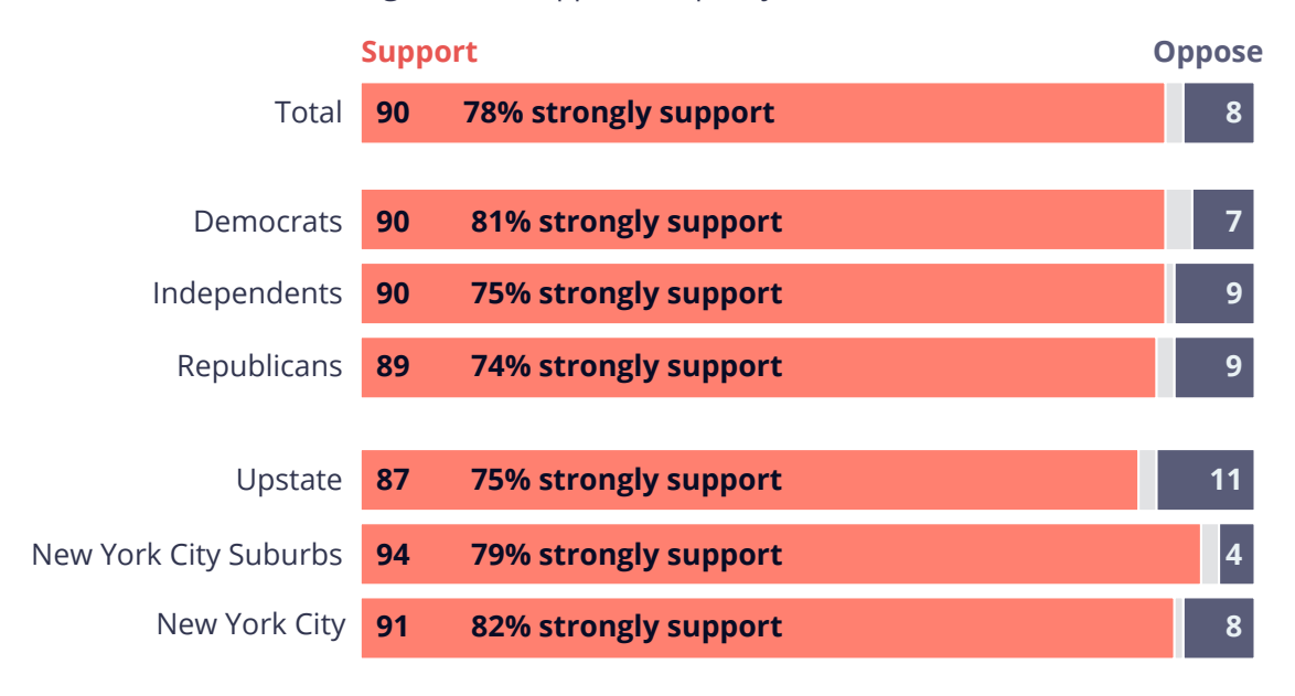
Figure 1.3 – Support for speedy trial reform

Voters believe those accused of a crime should be able to see the evidence against them be- fore deciding whether to plead guilty. More than three quarters of voters (78%) support this proposal that would keep individuals from pleading guilty without knowledge of the strength of the case against them. Again, this includes large majorities across subgroups: